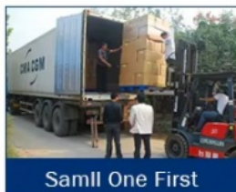
Small One First