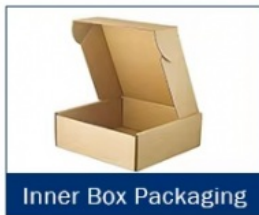
Inner Box Packaging