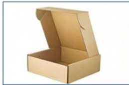
Inner Box Packaging