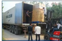
Small One First