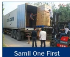
Samll One First