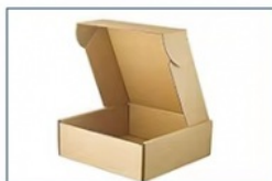
Inner Box Packaging