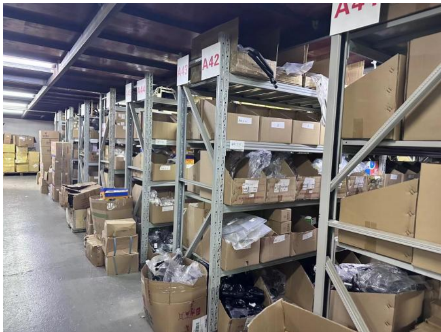
Auto Engine Parts 3RZ-4 Cylinder Head Wholesale for Toyota